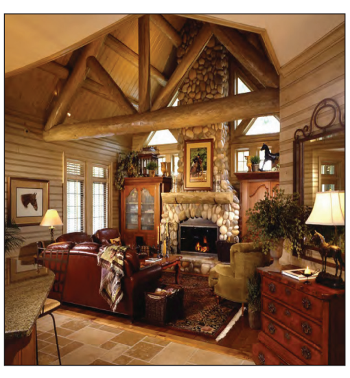
Log & Timber Homes

Flexibility and efficient installation make it a perfect fit for new construction applications as well as custom-built homes.