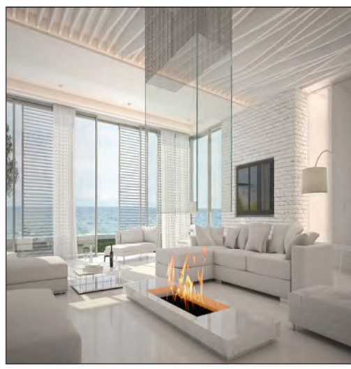
New Construction & Custom Built Homes

No matter when your home was built or what the physical configurations are, you can install The Unico System for high performance heating and cooling comfort.